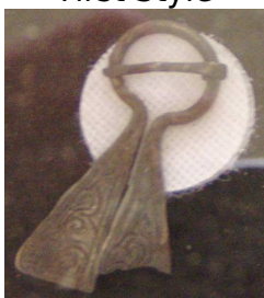
'Third style' - Scrollwork