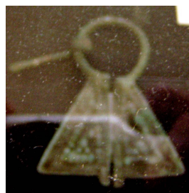
'Third style' – Granulated