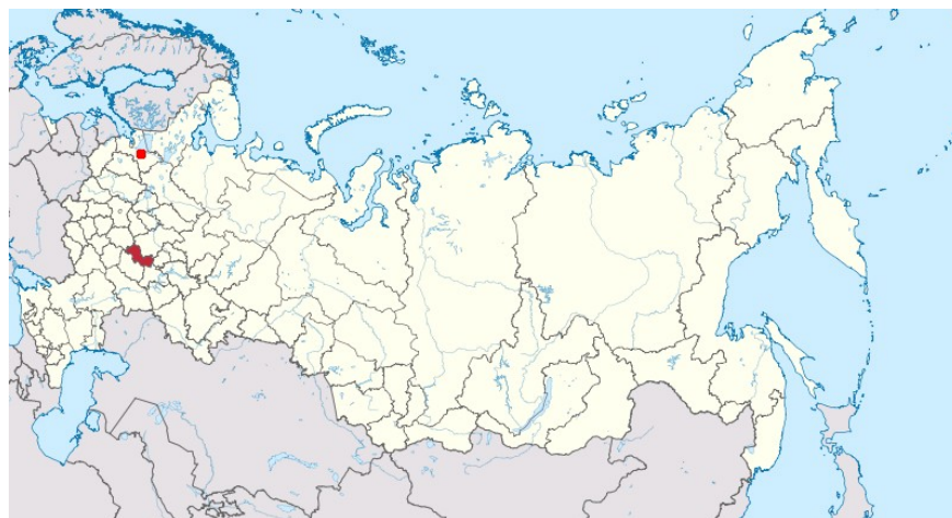
Figure 1: Map of the Russian Federation, showing the location of Staraya Ladoga (red dot) in the north-west, and the Republic of Mordovia (dark red) in the south-west. (Wikimedia Commons, 2011).

Finds from Staraya Ladoga in the early medieval period, even when carefully excavated, are problematic when trying to determine the origins of the deceased. The women were often buried there with a collection of Scandinavian, Finnish and Slavic jewelry, making it difficult to determine the “ethnic origins” of the deceased (Roesdahl and Wilson, 1992; 304). In any case, early 20 th century finds from the Hull and East Riding Museum, and the British Museum, indicate this jewellery style originated far away from Lake Ladoga, but further south in the modern-day republic of Mordovia.