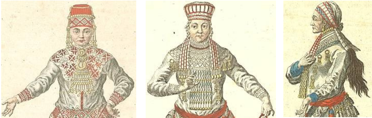
Figure 3: Late 18 th century images of Mordvin women.

Left: Drawing of a Mordvin woman (Georgi, 1799). NYPL Image ID: 1241926.